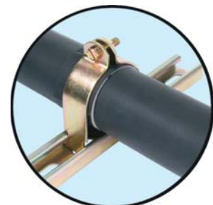
3. Wrap and seal with ProTape.