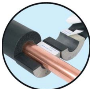
1. Slide insulation over pipe. Self adhesive surfaces provide seal.