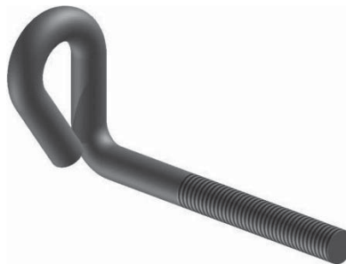
CORPORATION EYE BOLT