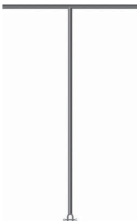
CURB BOX KEY